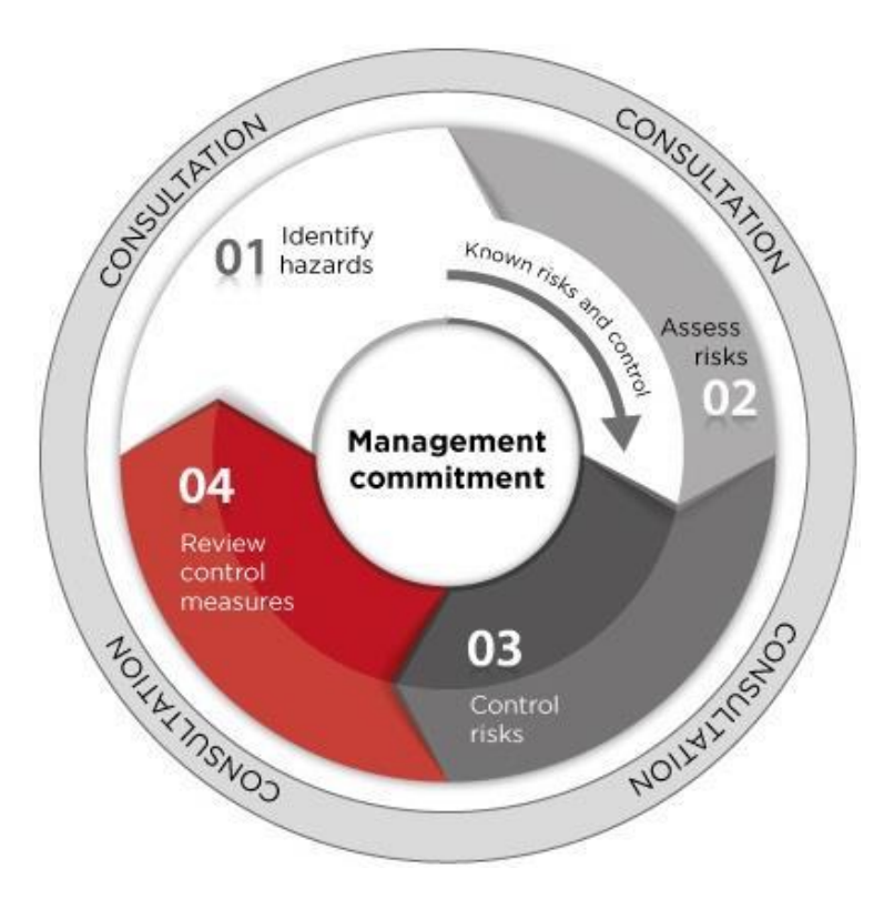
Figure 2. The risk management process

This process will be implemented in different ways depending on the size and nature of your organisation. Larger businesses or those where workers are exposed to more, or more serious psychological health and safety risks may need more complex and sophisticated risk management processes.