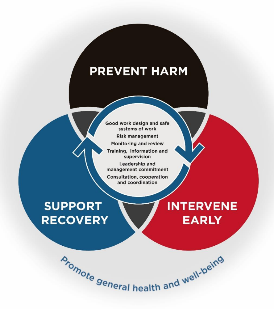
Figure 1. Systematic approach to psychological health and safety

Prevent harm – This element focuses on your duties under WHS laws. To do this you must systematically and comprehensively: