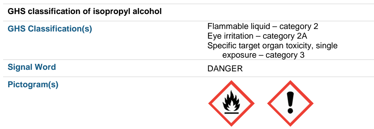
Table 2 GHS classification of isopropyl alcohol

By considering the information provided by both of these sources we can determine a suitable classification for isopropyl alcohol. Note that in this case we are using 'eye irritation category 2A' as recommended by NICNAS, rather than 'eye irritation category 2' as recommended by ECHA. This is because the NICNAS report includes data to support classification in sub-category 2A while the information published by ECHA does not include data that could lead to sub-categorisation.