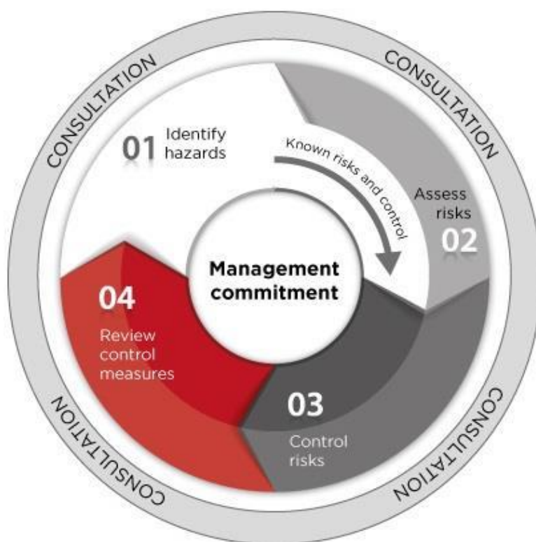
Figure 1 The risk management process

Further information is available in the Interpretive Guideline: The meaning of 'reasonably practicable' . The process of managing risk described in this Code will help you decide what is reasonably practicable in particular situations so that you can meet your duty of care under the WHS laws.