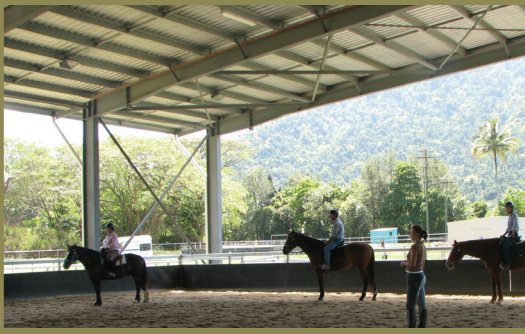
FIGURE 6 Enclosed area with fencing