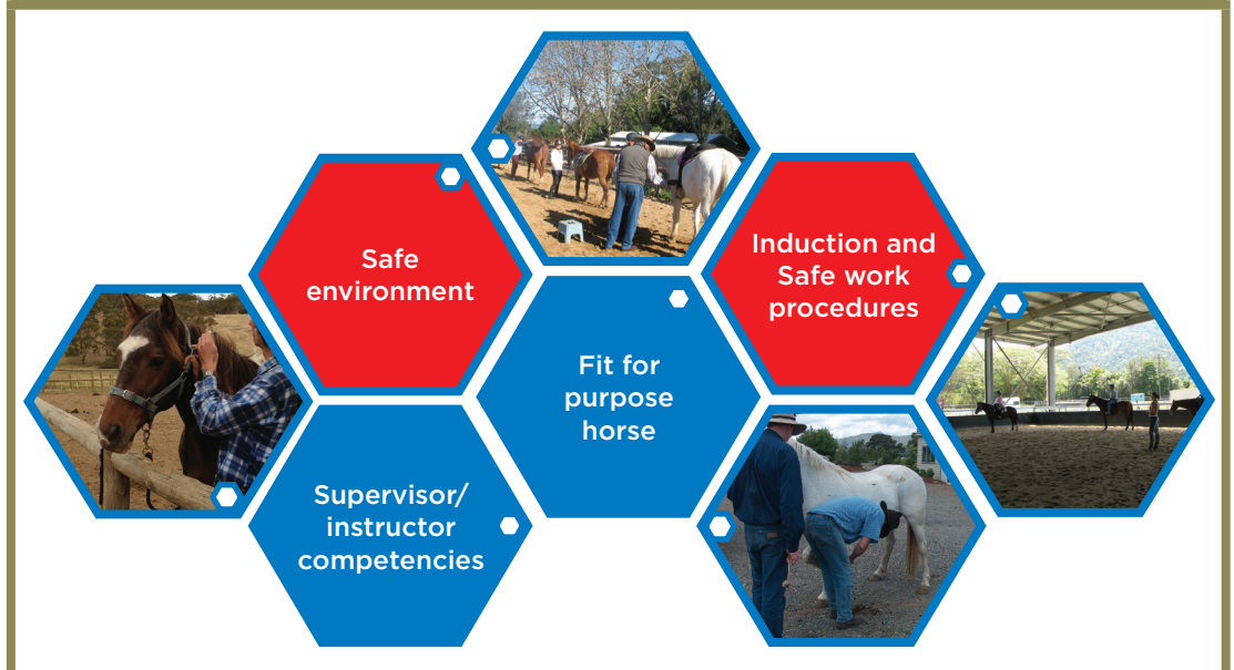
FIGURE 1 Key aspects of managing risks