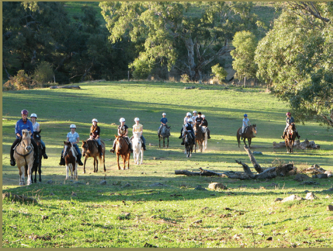
FIGURE 8 Riding in the open