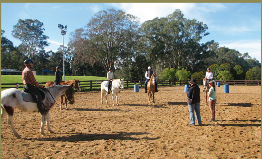
FIGURE 5 Instructor training