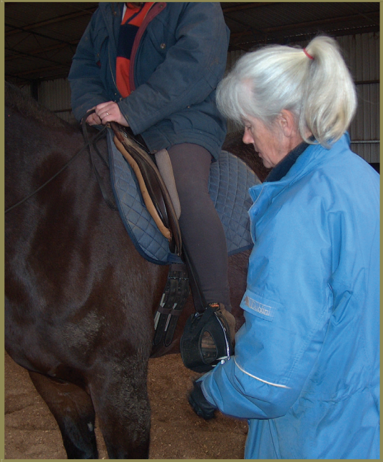
FIGURE 11 Adjust stirrups