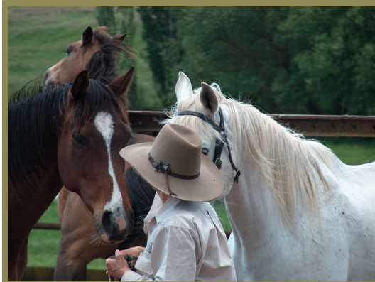
FIGURE 13 Catching a horse in a group