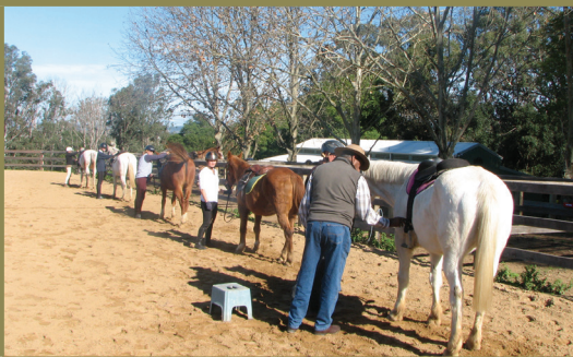
FIGURE 4 Line up for mount